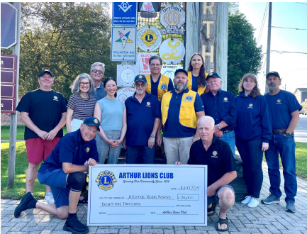
Arthur Lions Cheque Presentation

We were incredibly grateful to share the Arthur Lions' $25,000 donation this summer. This incredible club will be celebrating its 85 th anniversary this year, and has a vibrant and hard-working team in its active membership.